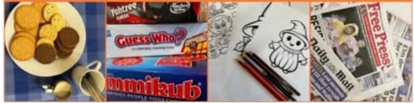
FREE for residents of Devauden and surrounding areas