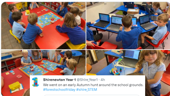
3 Shirenewton Year 1 @Shire_Year1 · 4h We went on an early Autumn hunt around the school grounds. #forestschoolfriday #Shire_STEM

Developing our coding skills using a variety of resources. Building, programming and exploring 🤖 @Shire_STEM @shirenewtonsch