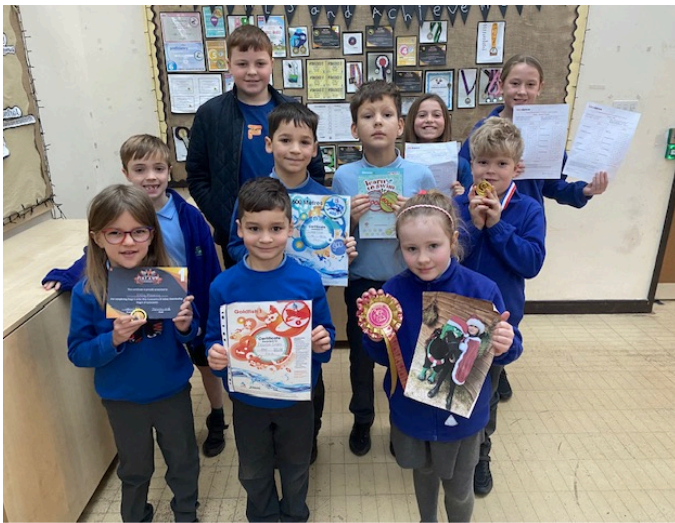
This weeks Talents and Achievements Assembly