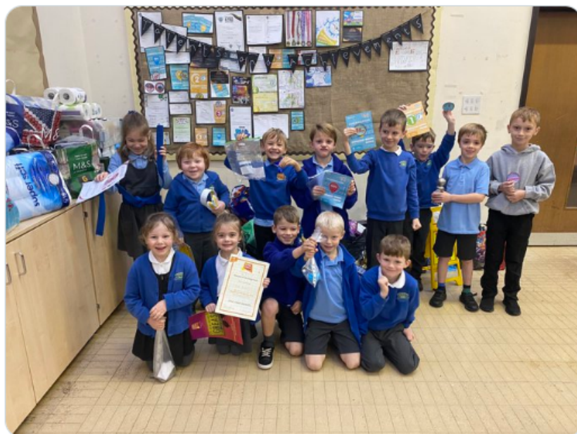
Shirenewton School @shirenewtonsch · Nov 14 Diolch yn fawr for sharing your talents and achievements this week 🥳 So impressed and proud of you all 🙌