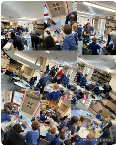
1 5 127

4 Shirenewton Year 4 @Shire_Year4 · Nov 15 Wow! What an incredible morning. This morning we had invited our adults in as part of our #antibullyingweek! We looked at how to help people who might be bullied and how being bullied might make them feel. We used what we discussed to help us create amazing poems as a group 🌟